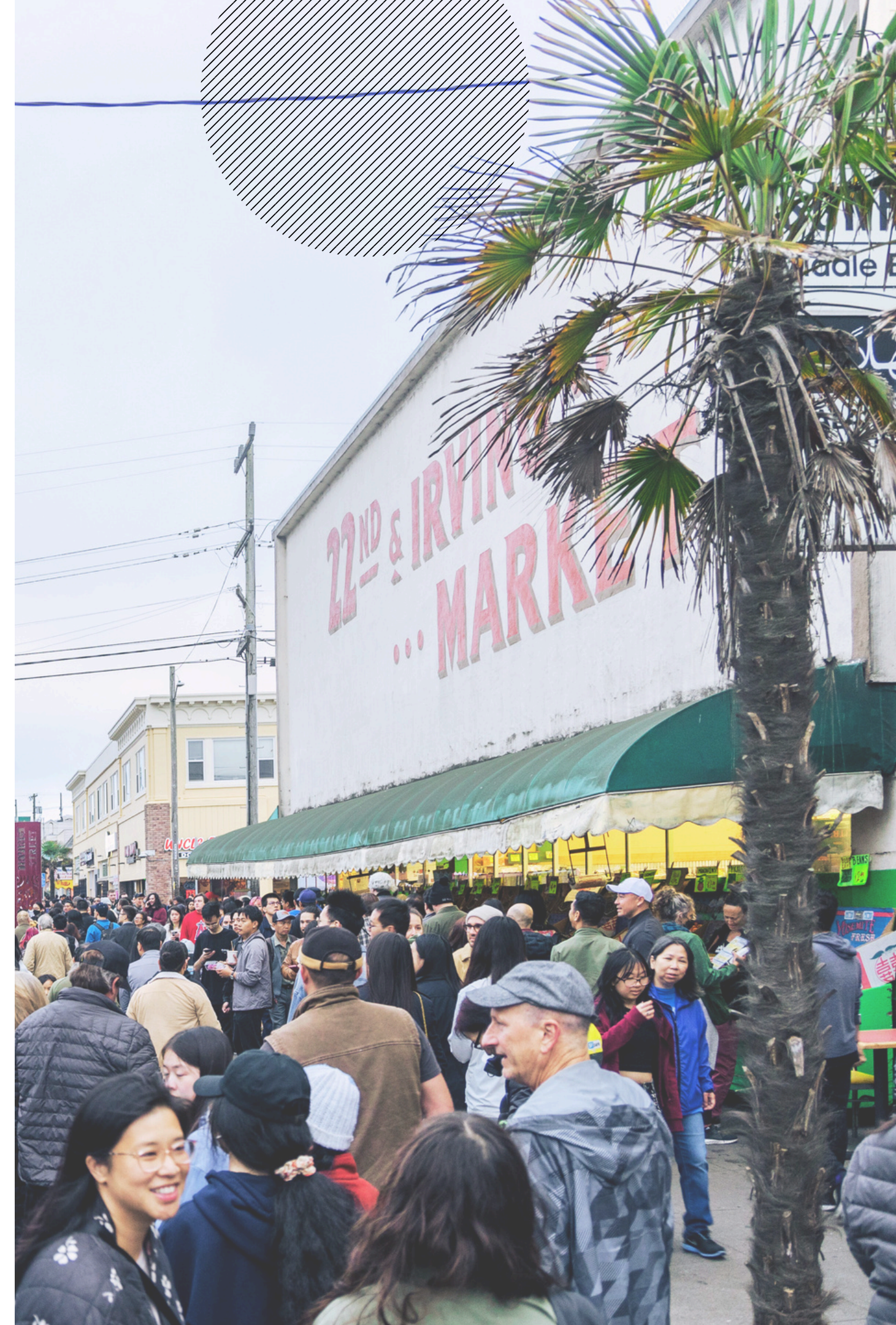
Sunset Night Market, 2023

As a sponsor, your brand will be featured at the heart of these community celebrations , connecting your business to our audience of San Franciscans who appreciate good food, sustainability, shopping local, and celebrating creativity .